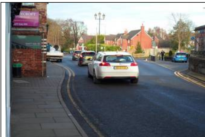
Narrow footway, London Rd / The Square

A separate report is being produced by the Traffic & Transport Working Group which will set out a detailed list of ideas to create a pedestrian-friendly village centre along the whole of this stretch of road.