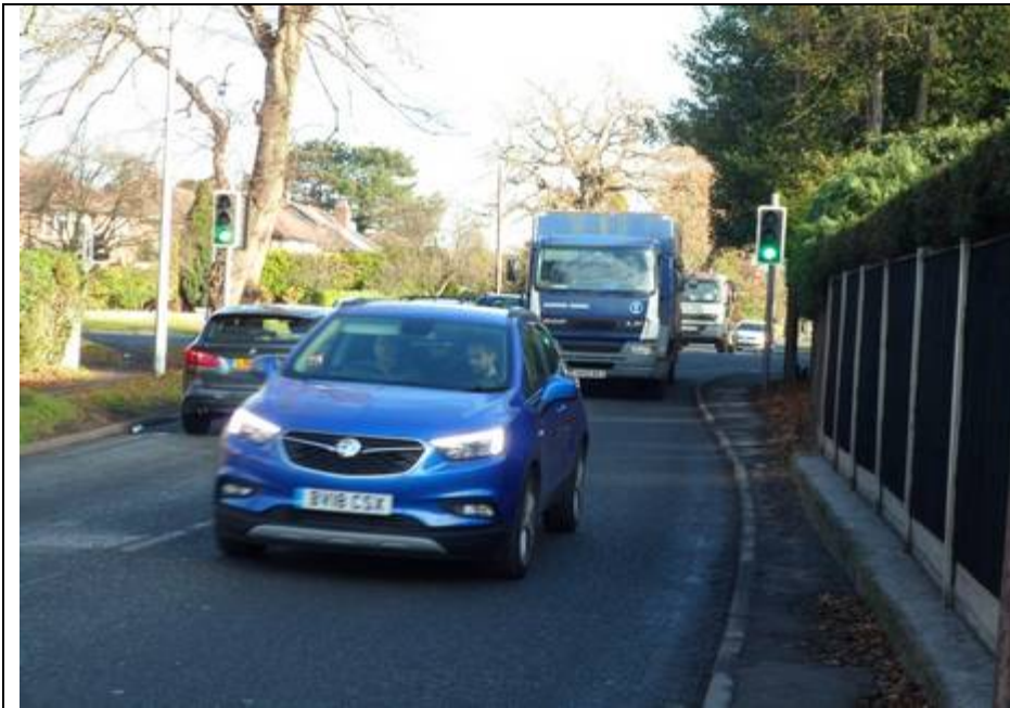
Chester Rd showing extremely narrow footway on south side

ROUNDBABOUT: CEC Highways are developing proposals to replace the traffic light control with a roundabout, which raises additional concerns over safe pedestrian crossing provision. This has been communicated to Cheshire East Highways and a petition was presented demonstrating the level of Community concern about the impact of this proposal. It is essential that safe pedestrian crossing provision is a fundamental part of any such scheme.