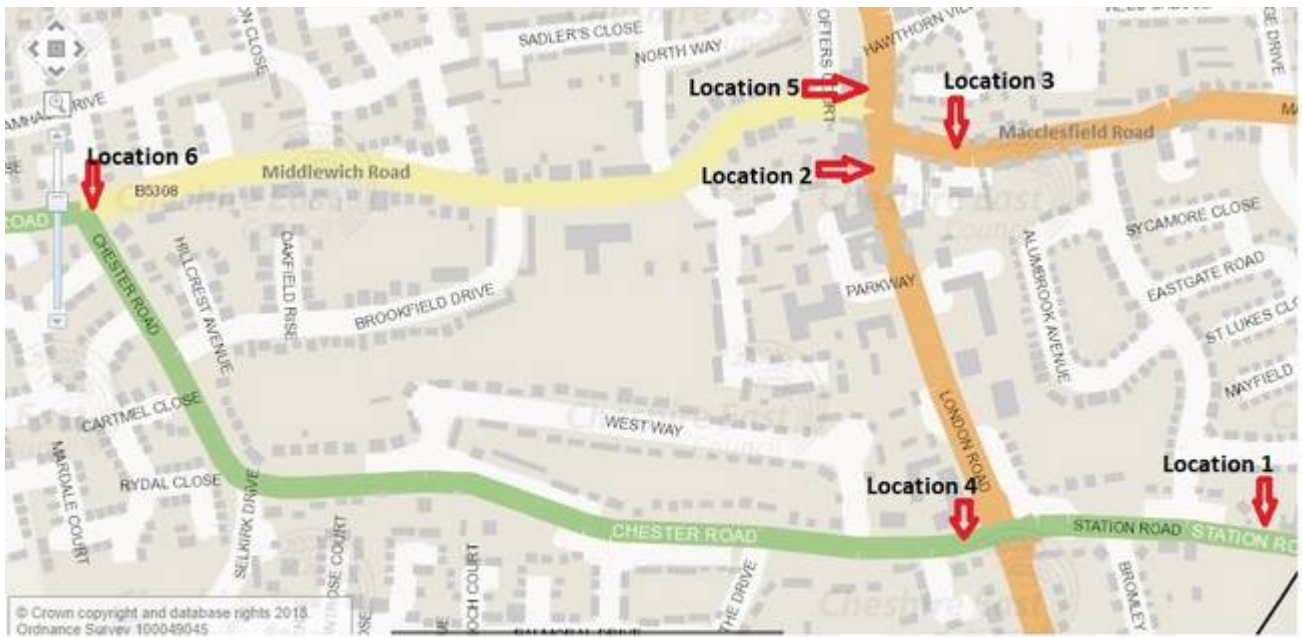
Holmes Chapel - Key accident risk locations identified in the text