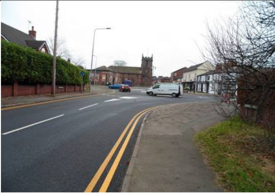
Knutsford Road approaching Macclesfield Road (centre left of image) and lack of centre refuge