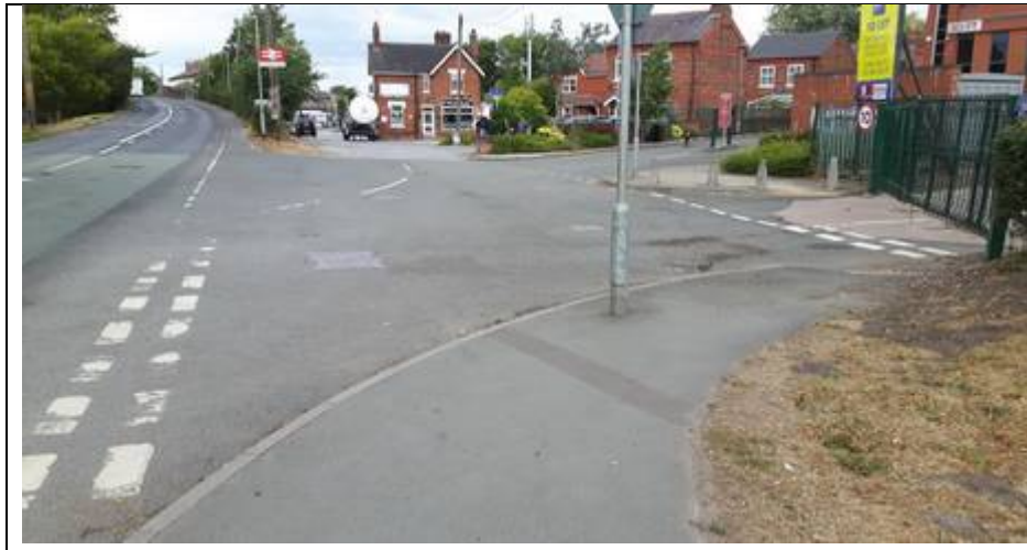
Entrance to railway station car park & business premises from east, showing station car park (ahead) & two business park entrances (rhs)