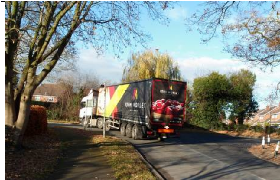
HGV turning from Chester Rd to Middlewich Rd

POSSIBLE MEASURES: Junction needs to be widened to allow HGV's to pull round. Could be converted into a roundabout to give better access turning right into/out of Chester road and avoid conflicts with HGV's turning into Chester Road and drivers waiting to turn right out of Chester Road.