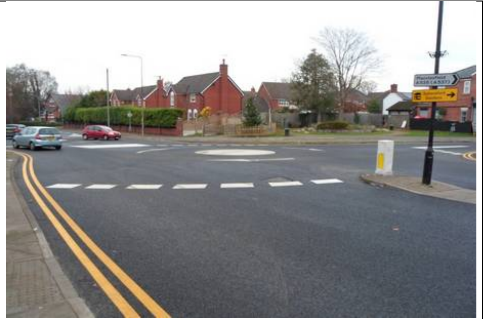
View towards Knutsford Road with Macclesfield Road to RHS & centre refuge on London Road / The Square