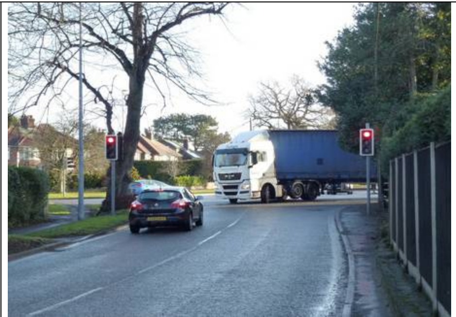
Chester Rd showing HGV hazard for crossing pedestrians