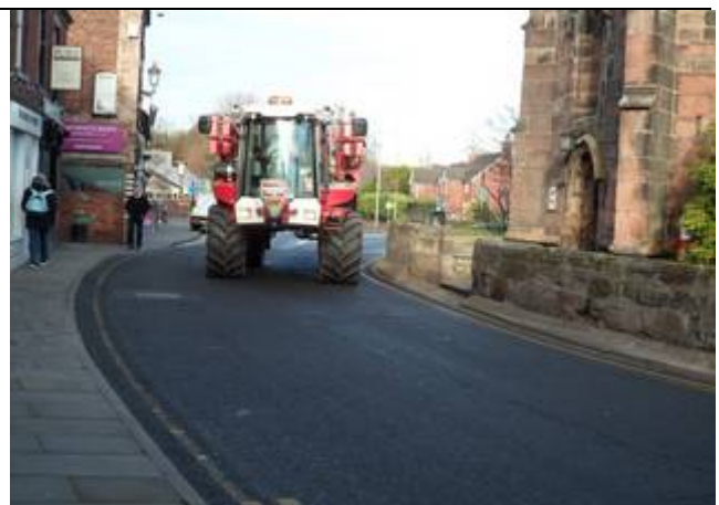
Hazard of large vehicles – London Road / The Square