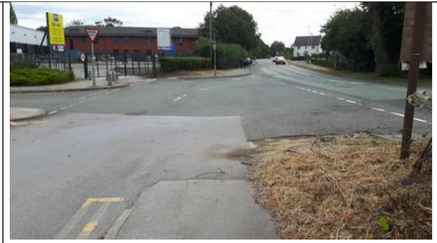
Entrance to station car park & business premises from west showing extent of pedestrian hazard