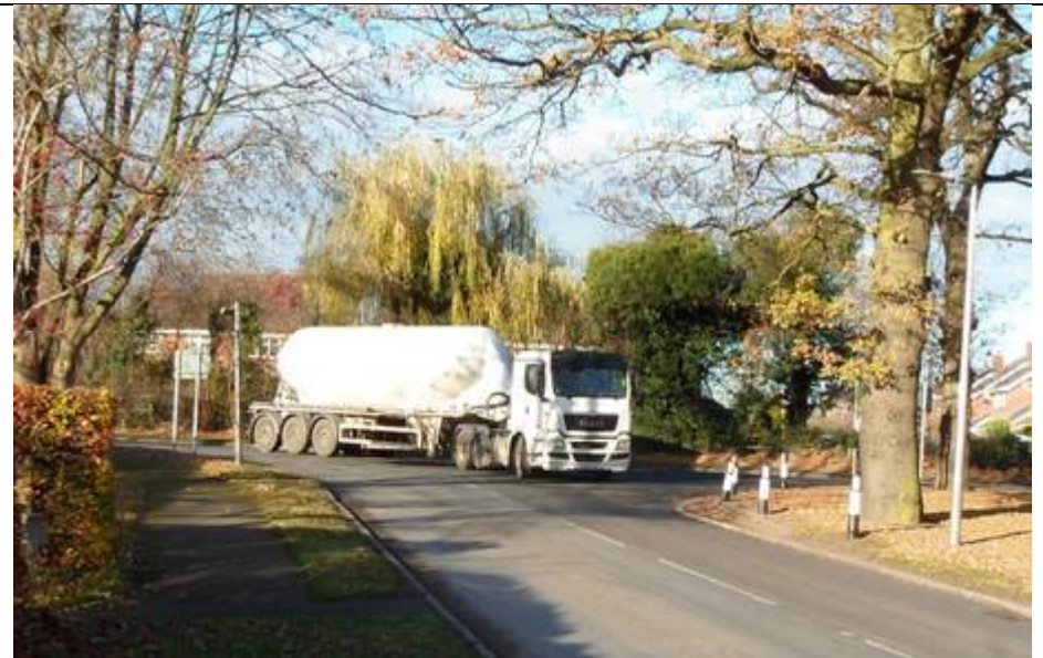
HGV entering Chester Rd from Middlewich Rd